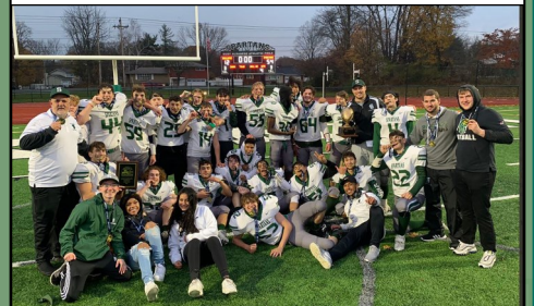
Varsity Football won the Section IX Championship.