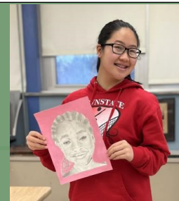
Todd art students created portraits of children in Cameroon for the Memory Project.