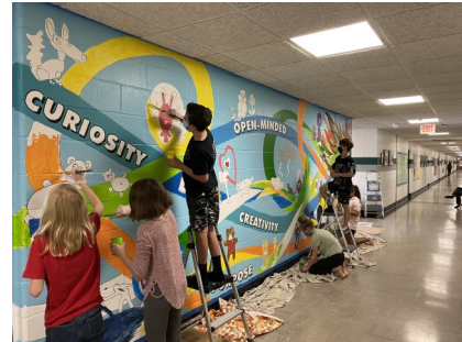
Above: Hagan fifth graders created a mural with words that reflect the character strengths and virtues of P2.

Both Nassau and Hagan Elementary Schools kicked off the Positivity Project (P2) this school year, while Todd Middle School is piloting the program. P2 emphasizes social-emotional learning and reinforces the idea that Other People Matter. Each month, principals at Hagan and Nassau recognize students whose teachers nominated them based on how they put character strengths and virtues like optimism, curiosity, and teamwork into action.