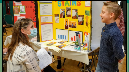
Hagan STEM Fair sparks early interest in science and enhances research skills.